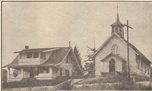
ST. MARY'S CHURCH AND RECTORY, ST. MARIES

Our Motto: "Co-operation" to Do Good for This Parish and Community